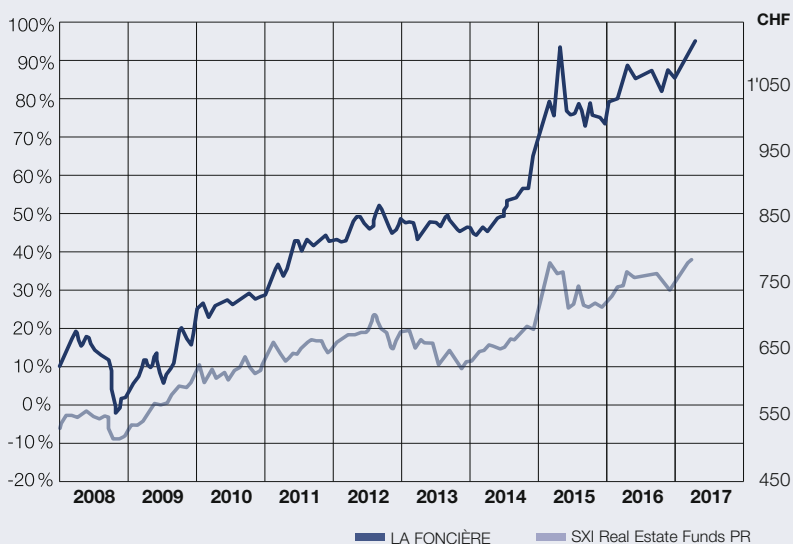
Evolution of the unit price from 01.01.2008 to 31.03.2017