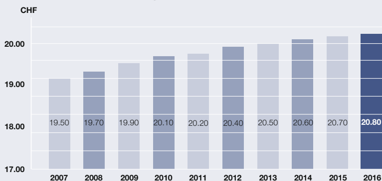
Evolution of the dividend per unit